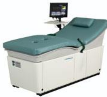
The Lumenair™ EECP® Therapy System

External counterpulsation (ecp) is a generic term for a circulatory assist technique first introduced by Drs. Harken, Birtwell and Soroff in the 1960's using a hydraulic (water) driven system with a single bladder encasing the lower extremities to produce diastolic augmentation and systolic unloading. With this hydraulic form of ecp system, a handful of clinical researchers conducted clinical studies in the areas of stable angina, acute myocardial infarction and cardiogenic shock. Some of these studies were positive and some were equivocal due to the limitations of the technology available at the time. While pneumatic ecp systems started to appear in the 1970's and 1980's, their performance was still not satisfactory.