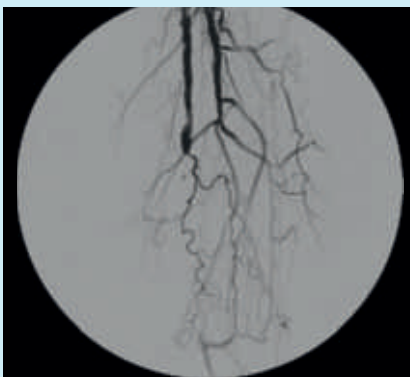
DSA angiography of the lower limb visualizes details of fine vessels with superb quality images.