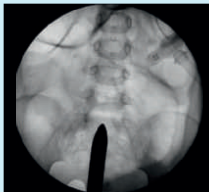
Pediatric abdomen - this image provides a high quality visualization of the entire abdomen at low dose levels.