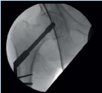
AP Hip - the BV Endura enhances image quality and manages X-ray dose by applying one shutter to visualize the dynamic screw.

Our full digital 1K 2 imaging chain includes powerful image processing functions, such as advanced noise reduction and 2D edge enhancement, providing high quality images time after time. It provides high quality fluoroscopy, subtraction runs, and roadmap guidance to support orthopedic, and vascular surgeons in performing challenging procedures. From complex fractures to minimally invasive vascular cases.