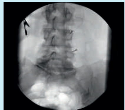
Pain management procedure - the BV Endura allows clinicians to visualize needle placement along the spine.