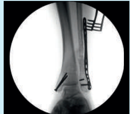
Ankle fracture - the BV Endura provides excellent image quality even without applying shutters to streamline workflow.