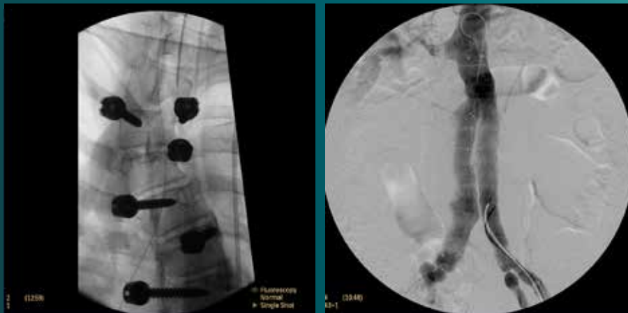
AP view Thoracic Spine - Fusion to reduce Scoliosis