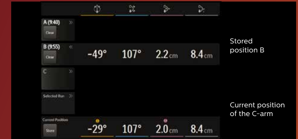
Position Memory stores a previous position and displays it on the monitor above the current position, helping the user quickly return to the desired view with great accuracy.