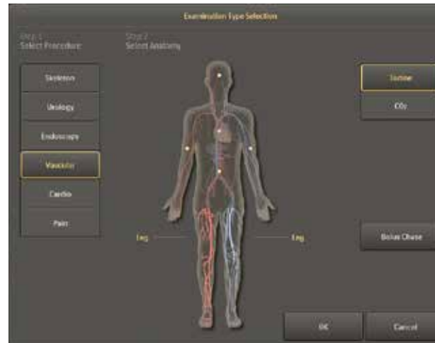
Conveniently select the procedure type and anatomy and the system will automatically deliver excellent image quality without applying more dose than necessary.

The Veradius Unity provides a pre-set list of acquisition settings grouped by types of exams. Now it's even easier to select the relevant procedure and anatomical area from the list and the system automatically applies the parameters to get the required image quality without applying more X-ray dose than necessary. Manual adjustments can be made as needed.