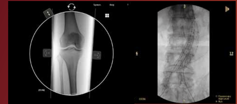
Swipe through images, pull up a large image, and collimate and rotate images with the touch of a fingertip on our intuitive touch screen.